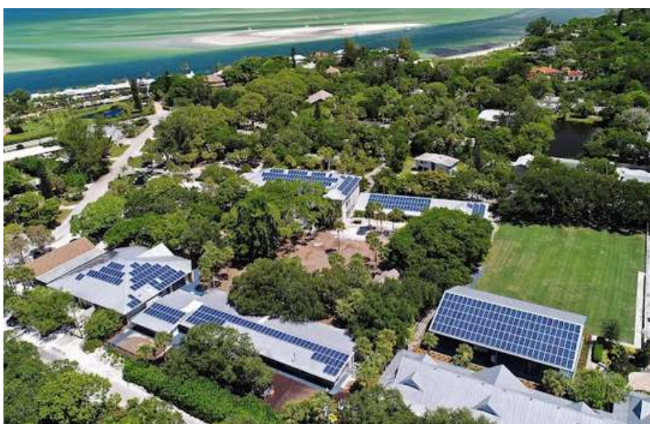
Out-Of-Door Academy | Siesta Key, FL

The area is home to exceptional public schools, innovative charter schools (like Pine View School for intellectually gifted students), prestigious private institutions—including Cardinal Mooney Catholic High School, Out-of-Door Academy (ODA), and IMG Academy—and prominent higher education options such as Ringling College of Art and Design, New College of Florida, and the University of South Florida Sarasota-Manatee.