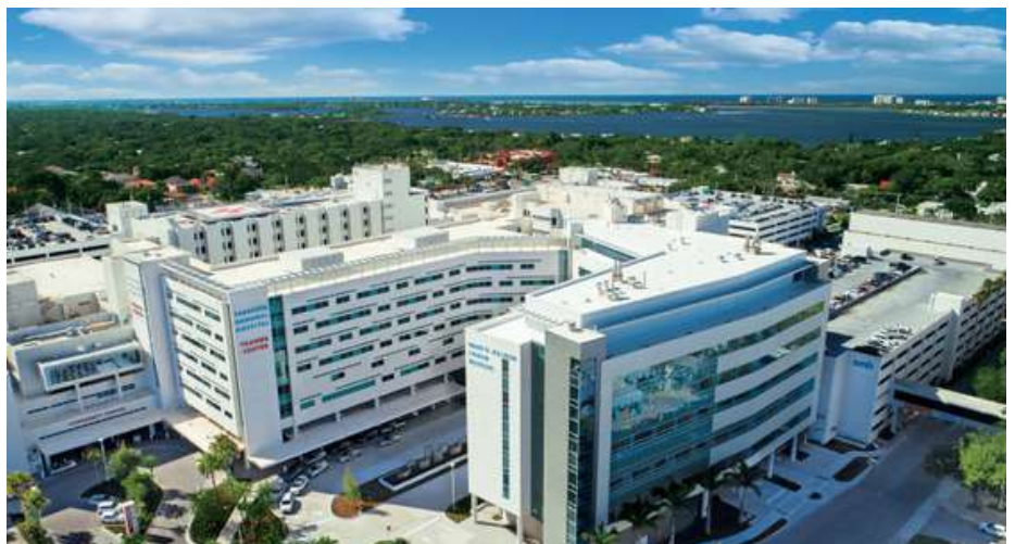
Sarasota Memorial Hospital